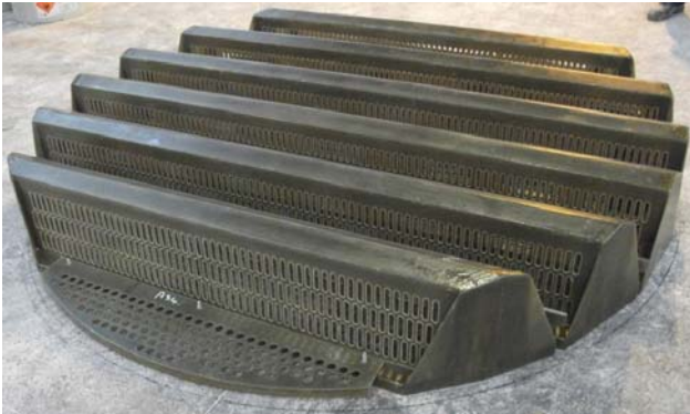
GRP – Ø 2376mm