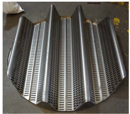
Titane / Titanium – Ø 1200mm