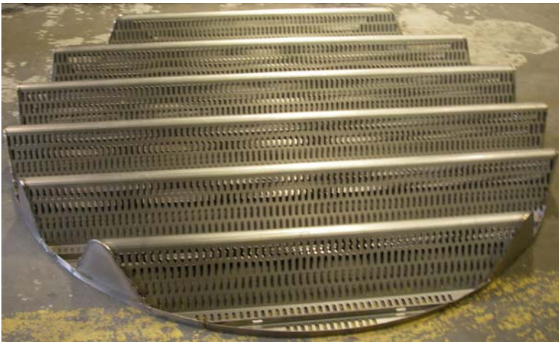
Titane / Titanium – Ø 2000mm