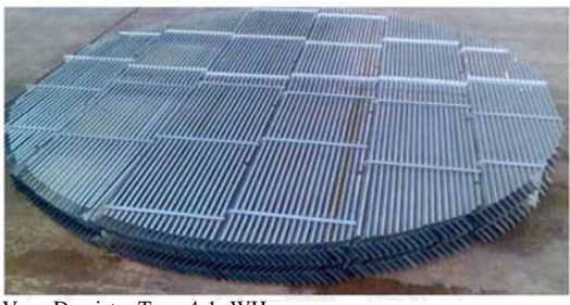
Vane Demister Type 4-1- WH Co1umn Ø 2700mm MOC 316L

With smooth profile blades typical removal efficiency is 100% removal of droplets 17µm and greater in diameter. Using blades with hooks the normal removal efficiency is 100% of droplets 10land greater in diameter.