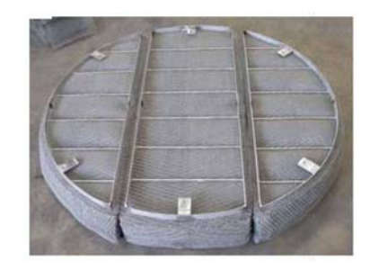
Mesh Demister Type RHO-145-9030 Pad tck 150mm - MOC 316L Column Ø 1600mm