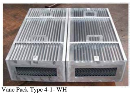
Face Area 1800mm x 2000mm MOC304L

With smooth profile blades typical removal efficiency is 100% removal of droplets 17µm and greater in diameter. Using blades with hooks the normal removal efficiency is 100% of droplets 10land greater in diameter.