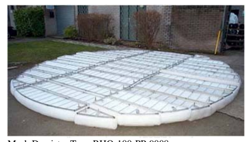
Mesh Demister Type RHO-100-PP-9008 Pad tck 150MM - MOC: PPL Column Ø 6500mm

Mesh pads are typically 150mm thick with 25mm thick grids on either side making an overall thickness of 200mm. Many years of experience have shown that a 150mm pad thickness provides optimum performance in hydrocarbon processes with a vertical gas flow configuration.