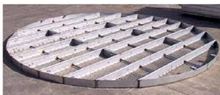
Model 310 Bed Limiter for random Packing 3810mm Ø Seawater Deaeration Column

For small columns one piece construction is used (Model nos. 300 & 301). Segmental construction is used for large diameter columns (Model nos. 310 & 311).