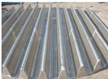
Model 110 Support Plate - Random Packing 4300mm Ø Deaeration Tower MOC 316L