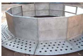
Model 740 Two Phase Feed Distributor Flashing Gallery Nozzle Ø20"nb 3800mm Ø C02 Stripper

Sparge Pipe c/w Shroud Flashing Gallery Vane Inlet Device