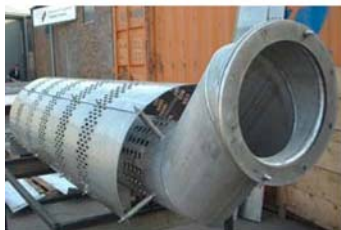
Model 750 Two Phase Feed Distributor Sparge Pipe c/w Shroud Nozzle Ø 12"nb, 4270mm Ø Stabilizer Column