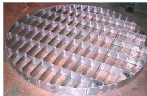
Model 150 Support Grid - Structured Packing 1800mm Ø IPA Distillation Column

Model 140 series - one piece construction (for installation through column body flanges) is used for small diameter columns. A partial support ring or wall clips welded to the column shell are required for supporting the grid.