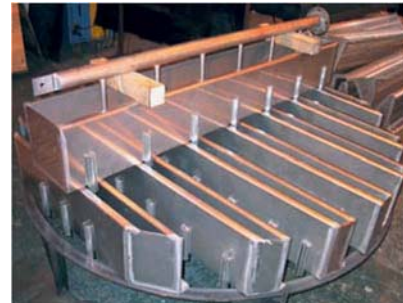
Model 231-CP Narrow Trough Distributor 1800mm Ø IPA Distillation Column

Model nos. 220 & 230 have holes in the deck and are used for non fouling services. For fouling services the holes are put in the sides of the troughs. Normal operating range is 2 to 1.