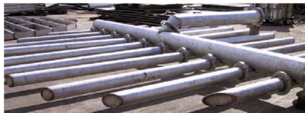
Model 252 Pipe Ladder Distributor in 316L

Pipe ladder distributors are particularly suited for systems with high liquid to vapour ratios.