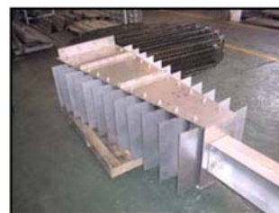
Model 760 Two Phase Feed Distributor Vane Inlet Device Nozzle Ø 1200mm nb, Column Ø 2800mm