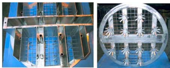
Model 223-AM Narrow Trough Liquid Distributor 800mm Ø Esterification Column

Using double or triple holes in the sides of the trough the distributor can be designed for operating ranges of 5 to 1 or more. For the high turndown designs an alternative is to use drip tubes welded to the deck (Model nos. 222 & 232) with the distribution holes in the sides of the tubes.